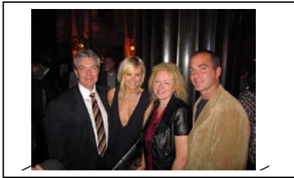
Toronto Film Festival 2010

Always working to protect your assets and financial future!