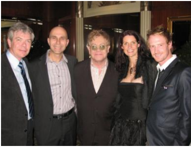
Yes that's me on the left with Sir Elton John

Always working to protect your assets and financial future!